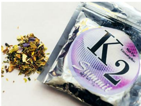
K2, a popular brand of “Spice” mixture.

Some Spice products are sold as “incense,” but they more closely resemble potpourri. Like marijuana, Spice is abused mainly by smoking. Sometimes Spice is mixed with marijuana or is prepared as an herbal infusion for drinking.